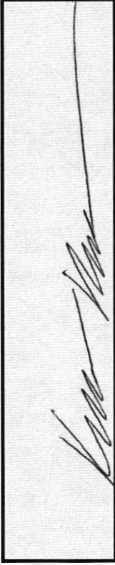
Keith Nabours Commissioner, Precinct #2